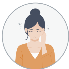
Headaches and/or swelling